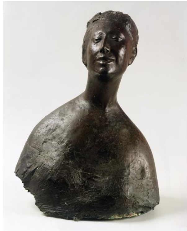
Giacomo Manzù, Bust of a Woman, 1952