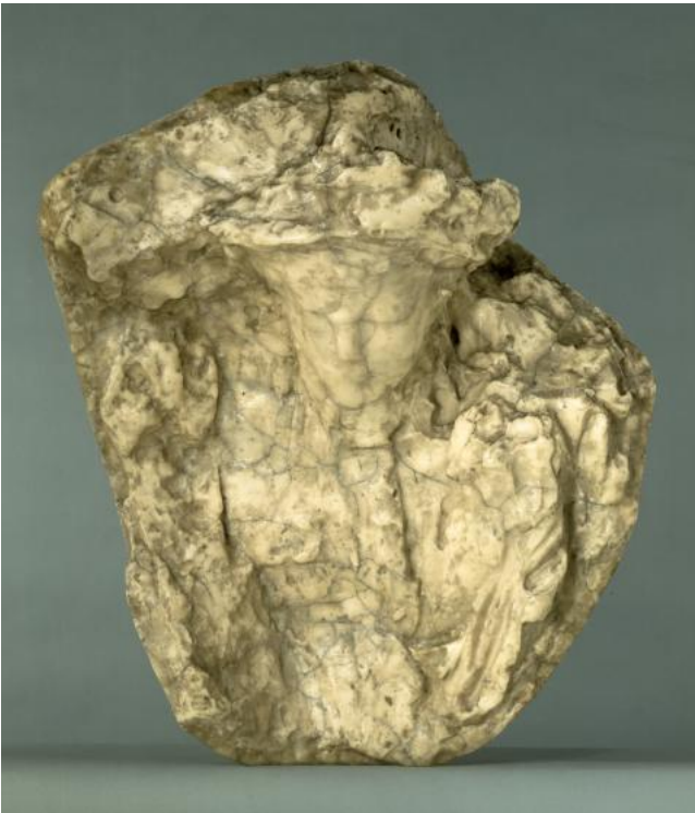
Medardo Rosso, Impressions of the Boulevard, Woman with a Veil, 1893

A bust is a sculpture of someone's head, shoulders and chest. Below are two examples of busts in the Estorick Collection. Medardo Rosso depicts a glimpse of a woman in a busy boulevard lifting a veil over her head and is made of metal, plaster and wax. The image on the right is a bust by Giacomo Manzù and is cast in bronze. Note how the style of her relaxed shoulders and the way she's smiling and looking up conveys contentment and hopefulness. This activity focuses on learning how we express different emotions with faces, head and shoulders and create a photographic version of a bust and works best in pairs.