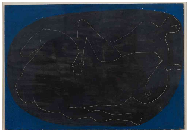
Marino Marini Horse and Rider, 1949