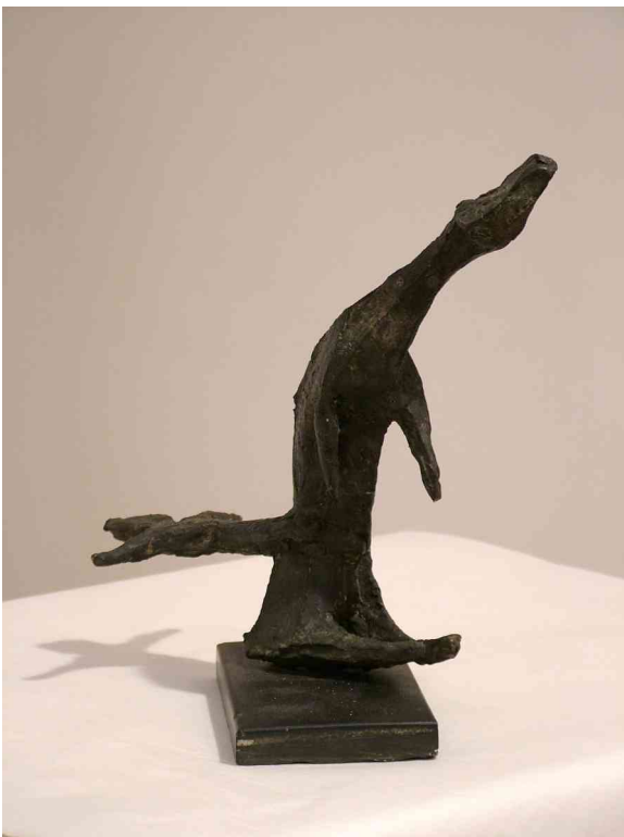
Marino Marini, Study for 'The Miracle', 1954-55