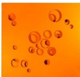
7. Paolo Scheggi Curved Intersurface in Orange, 1969 Intersuperficie curva dall'arancio Orange acrylic on three superimposed canvases, 120 x 120 x 6.5 cm Franca and Cosima Scheggi Collection, Milan