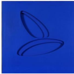
1. Paolo Scheggi Reflected Zones, 1964 Zone riflesse Blue acrylic on three superimposed canvases, 100,5 x 100 x 7 cm Private Collection, Florence – Courtesy Tornabuoni Arte

Estorick Collection of Modern Italian Art, London, www.estorickcollection.com @Estorick