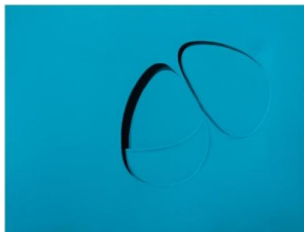
5. Paolo Scheggi Reflected Zones, 1964 Zone riflesse Blue acrylic on three superimposed canvases, 70 x 80 x 6 cm Private Collection, Florence