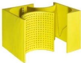
4. Paolo Scheggi Maquette for the 'Plastic Interchamber', 1966 Maquette della 'Intercamera plastica' Sheets of curved, punched wood painted yellow, 52.5 x 86 x 66 cm Franca and Cosima Scheggi Collection, Milan