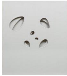
2. Paolo Scheggi White Curved Intersurface: Construction on the Rotation of a Logarithmic Spiral Gamma Object, 1964 Intersuperficie curva bianca. Costruzione su rotazione di spirale logaritmica oggetto gamma White acrylic on three superimposed canvases, 78 x 69 x 7.8 cm Private Collection, Florence