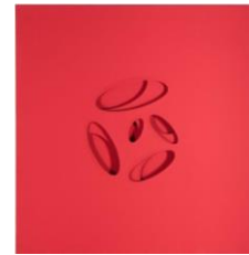
3. Paolo Scheggi Curved Intersurface, 1965 Intersuperficie curva Red acrylic on three superimposed canvases, 100 x 100 x 6 cm Franca and Cosima Scheggi Collection, Milan