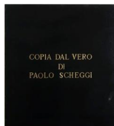
8. Paolo Scheggi Copy from Life by Paolo Scheggi, 1970 Copia dal vero di Paolo Scheggi Bronzed text on formica-covered wood, 62 x 63 x 2 cm Franca and Cosima Scheggi Collection, Milan