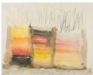
5. Fausto Melotti Senza titolo ( No title ), 1955 Tempera, pastel colour and burn marks on paper 25 x 33.5 cm