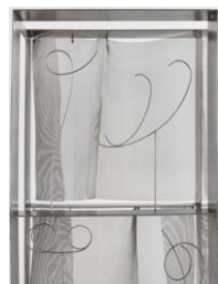
10. Fausto Melotti Contrappunto XII ( Counterpoint XII ), 1975 Stainless steel Ed. 1/3 100 x 100 x 30 cm