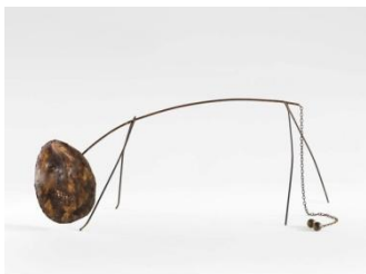
9. Fausto Melotti L'amico leone ( The Lion Friend ), 1960 Brass Unique 35 x 86 x 25 cm