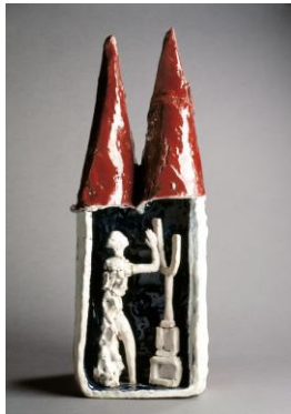
1. Fausto Melotti Orfeo ( Orpheus ), 1945 ca Glazed polychrome ceramic 59 x 20 x 10 cm

Estorick Collection of Modern Italian Art, London, www.estorickcollection.com @Estorick