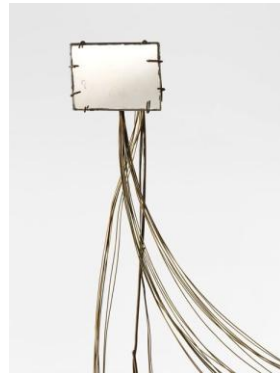
3. Fausto Melotti La coscienza inquieta ( The Uneasy Conscience ), 1973 Brass, mirror 88 x 57.5 x 33 cm