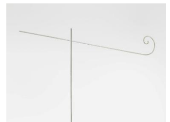
8. Fausto Melotti Scultura C (Infinito) Sculpture C (Infinite) , 1969 Stainless steel, AP of edition of 3 + 1 AP, 281.9 x 115.9 x 80 cm