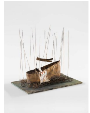
4. Fausto Melotti In palude ( In the Swamp ), 1984 Brass, painted wood, painted fabric 41 x 42 x 26 cm