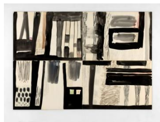
6. Fausto Melotti Studio per contrappunto ( Study for counterpoint ), 1962 Tempera, pastel colour and pencil on paper, 35 x 50 cm 4 sheets, Total dimension: 100 x 70 cm